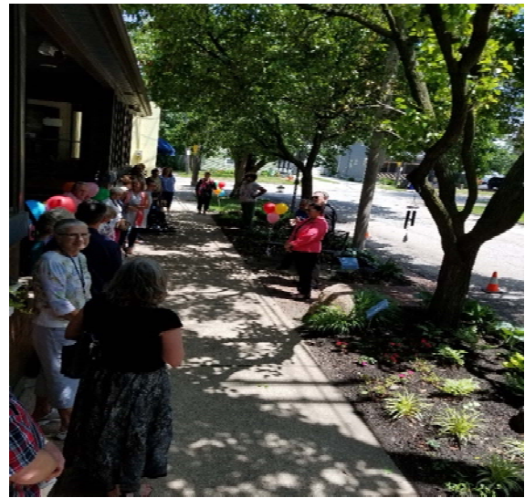
The dedication and a view of the garden.