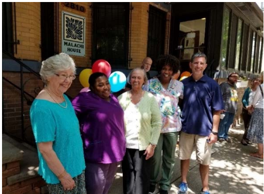
Guests for the dedication.