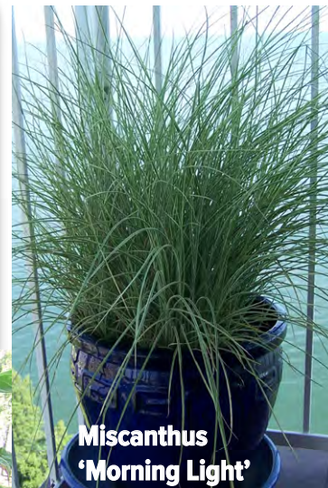
Miscanthus 'Morning Light'