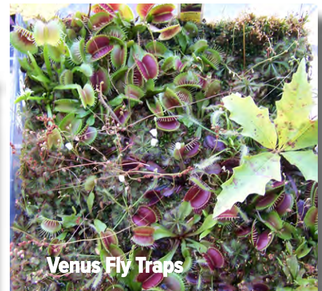
Venus Fly Traps