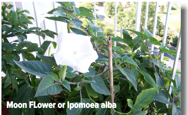
Moon Flower or Ipomoea alba