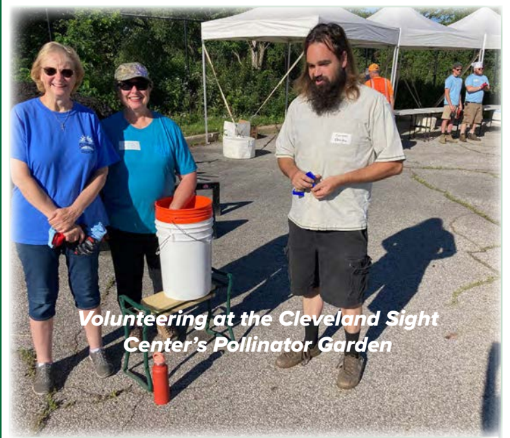
Volunteering at the Cleveland Sight Center's Pollinator Garden