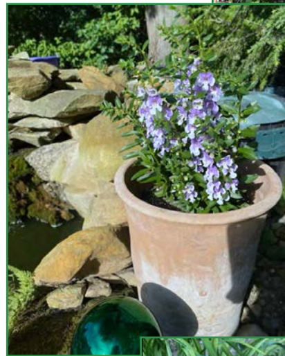
Hiedi Winston's angelface snapdragons & daylilies