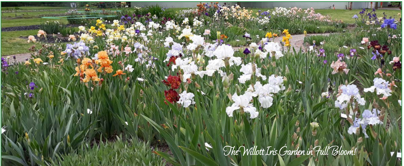
The Willott Iris Garden in Full Bloom!